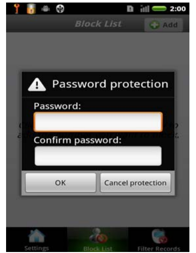
Fig2: Black-list password protection

. The above figure explains the view to add members to the black-list from several sources like from message log, from contacts and also from calls log. Members are automatically added.